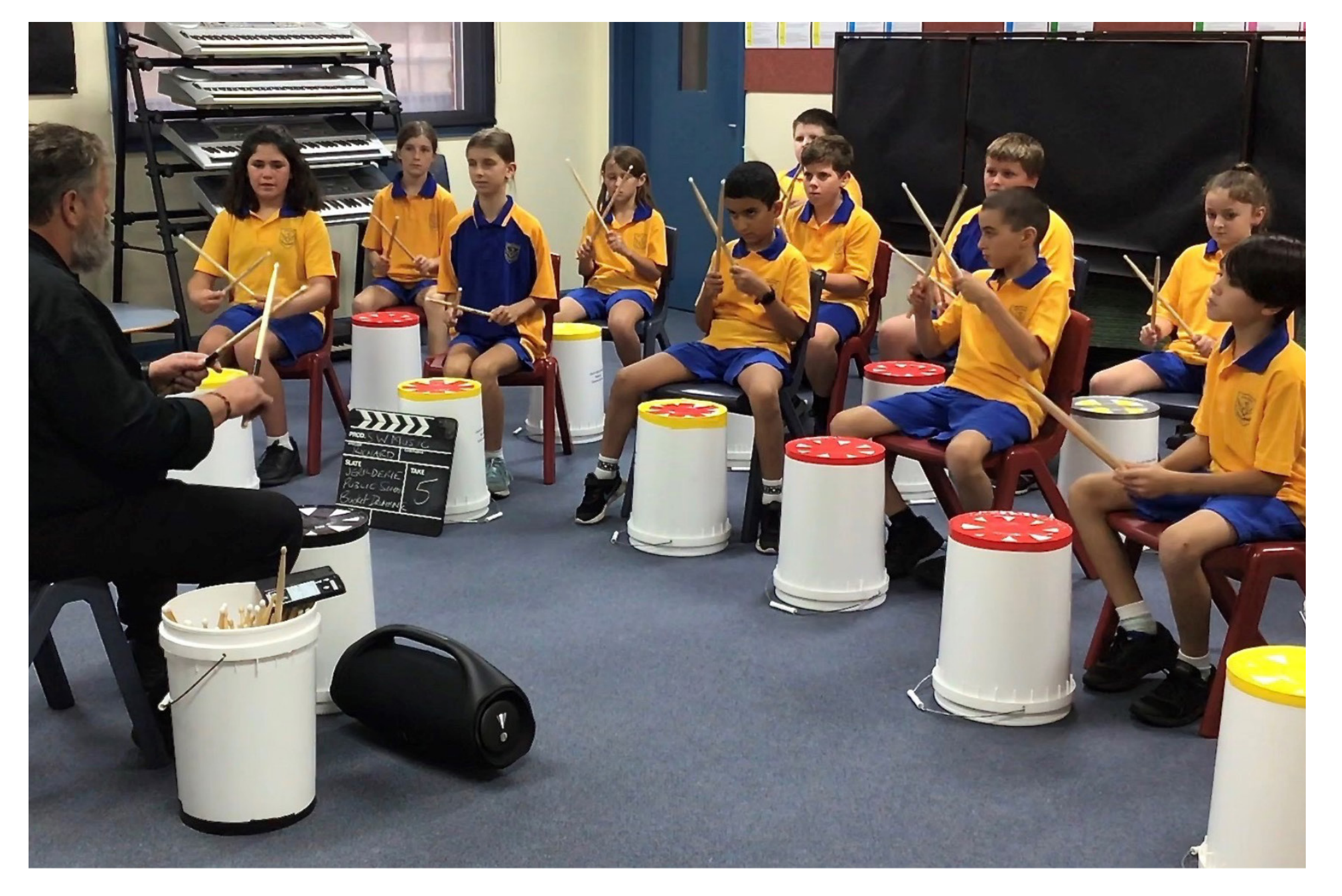
Bucket drumming is popular with students and accessible to all abilities.

The impact of COVID-19 required SWMRC to offer alternative group music activities in classrooms. Eight schools participated in our classroom bucket drumming program in the financial year. Preschools, primary and secondary schools were enthusiastic participants.